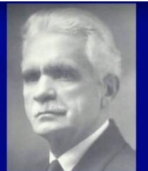
B.H. Roberts Comprehensive History of the Church 2:138

[133] "...if Joseph Smith's translation of the Egyptian parchment could be discredited, and proven false, then doubt would be thrown also upon the genuineness of his translation of the Book of Mormon, and thus all his pretensions as a translator would be exposed and come to naught."